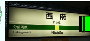
EAST JAPAN RAILWAY