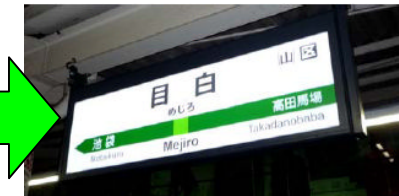
Automatic on-off systems and LED displays (JR East)