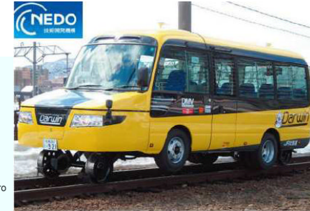
Dual Mode Vehicle (JR Hokkaido)