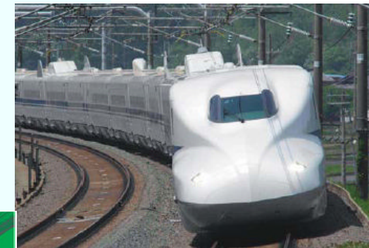
N700 Series Shinkansen (JR Central & JR West)