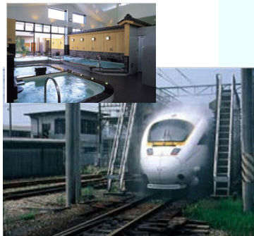
Reusing water at workshops (JR Kyushu)