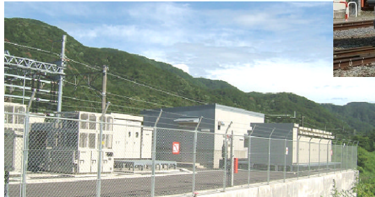
Electricity Storage System (JR West)