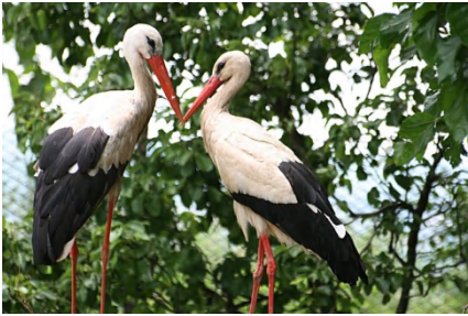
White Stork (Ciconia ciconia)

The electrical poles of the NRIC’s catenary are often a preferred place by the white storks, for building their nests.