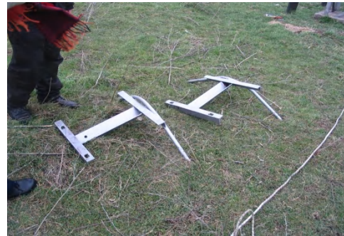
Platform developed for a pilot installation of Orizovo station

According to the current Bulgarian legislation the activities on the White Stork nests moving or demolition require a specific authorization by the competent authority - Ministry of Environment and Waters and Regional Inspectorate of Environment and Waters in particular.